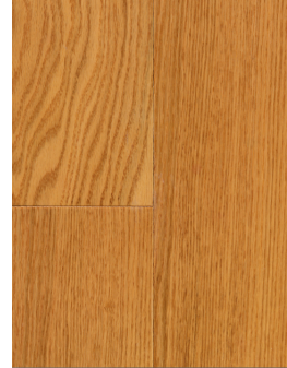
Oak - Wheat