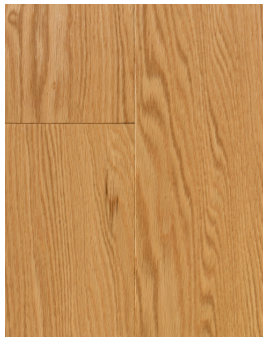
Oak - Natural