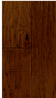
Hickory Hammer Glow